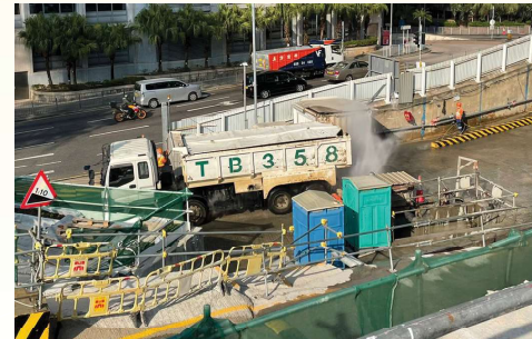
Automatically wheel washing system has been set up at exit and dump trucks are fully covered

In order to prevent vehicle-pedestrian collisions, dump trucks must follow the instructions given by the traffic controller when leaving and entering construction site.