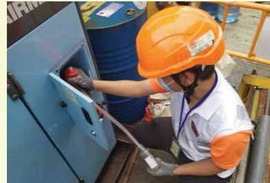
Collecting diesel samples