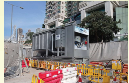
Processing of effluent with Sewage treatment plant before discharge