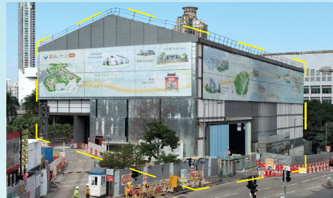
Ho Man Tin temporary noise enclosure is in operation

Temporary noise enclosure at Ho Man Tin works site has been erected and put into operation.