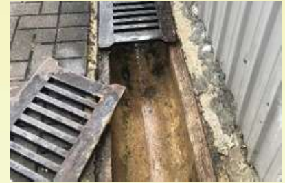
Removing stagnant water