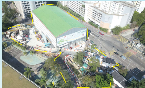
Aerial view of Ho Man Tin works site